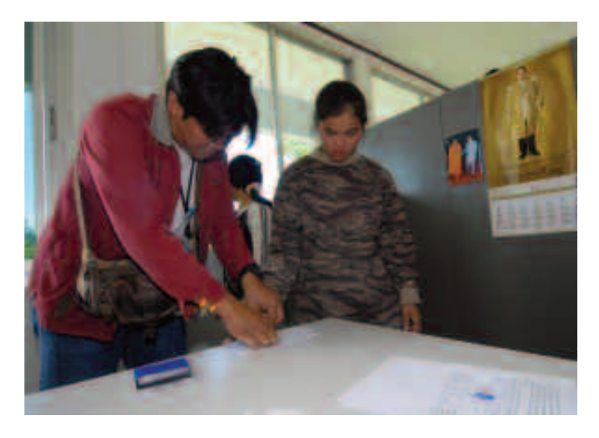
A Thai immigration official fingerprints an undocumented migrant from Burma at the local police station in Mae Taeng, Chiang Mai district.