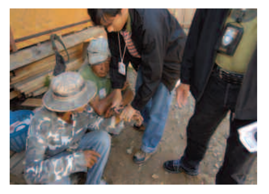
A Thai immigration officer handcuffs an undocumented migrant worker from Burma during a raid on a construction site.

Beyond threats of ill-treatment, extended detention, and deportation, migrants constantly fear extortion by the police. Nearly all migrants held in police custody that we interviewed