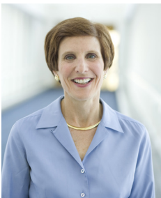
IRENE ROSENFELD CHAIRMAN AND CHIEF EXECUTIVE OFFICER MONDELÉZ INTERNATIONAL

“ At Mondelēz International, we are committed to treating everyone fairly. Through our Cocoa Life programme we’re driving best practices in the cocoa supply chain. We’re helping to create empowered, thriving cocoa communities by teaching them to work together to tackle root causes and develop lasting solutions. ”