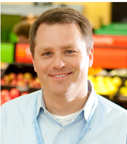
DOUG MCMILLON CHIEF EXECUTIVE OFFICER WALMART

“ We will play a leadership role in promoting the dignity of people who make the products we sell. Those who work in our supply chain should be recruited and employed responsibly. ”