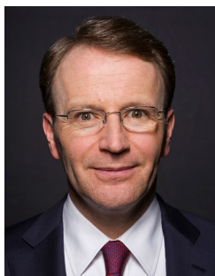
MARK SCHNEIDER CHIEF EXECUTIVE OFFICER NESTLÉ S.A.

“ Forced labour has no place in our operations and value chains. ”