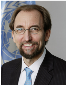
ZEID RA'AD AL HUSSEIN

We hope these case studies will inspire more learning on the key role of business in combatting forced labour and that they encourage effective private sector action to respect and support human rights.