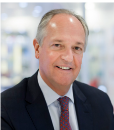
PAUL POLMAN CEO UNILEVER

“ Respecting human rights is the necessary foundation for sustainable and responsible business. We acknowledge the risk of forced labour occurring in global supply chains and know there’s more we can do to strengthen our process in this area. No one sector can successfully address these issues alone which is why we will continue to work with our business partners to create positive change. ”