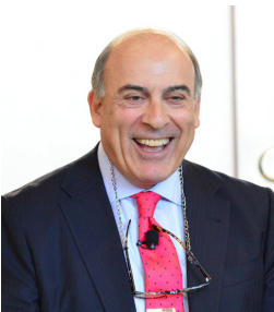
MUHTAR KENT CHAIRMAN OF THE BOARD THE COCA-COLA COMPANY

“ Today’s stakeholders - including our associates and future associates - are judging us as much on the content of our character as they are on the quality of our beverages that refresh the world. Nothing speaks more to our character than the way we treat our fellow human beings. ”