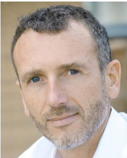
EMMANUEL FABER CHIEF EXECUTIVE OFFICER DANONE

“ We believe that the ultimate goal of market economy cannot be anything other than social justice. Human Rights must form the basis of a company’s relationship with its ecosystem, in particular with the most vulnerable partners of the supply chain. ”