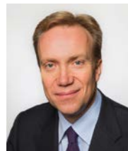
Børge Brende Minister of Foreign Affairs

Special thanks go to the business sector and civil society for their input to the work on the plan.