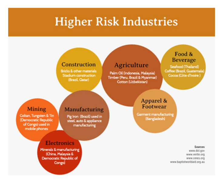
Figure 1: Higher Risk Industries including key products and source countries

Agriculture is considered higher risk as migrant and seasonal farmworkers, including children, are often victims of trafficking or exploitative and illegal labour brokers. There are linkages across industries as for example, cotton produced by forced labour may enter supply chains for not only clothing companies but also food manufacturing via cottonseed oil. Timber produced by countries such as Peru, Brazil and Myanmar (Burma) may enter the supply chains of construction companies. Some higher risk industries with examples of key products are shown in Figure 1 below.