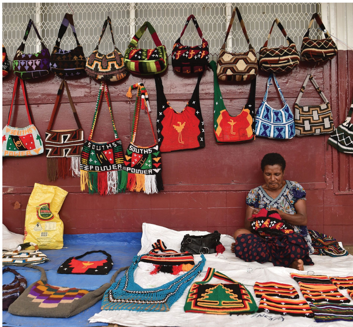
●● A woman displays local hand-made bags known as bilums for sale on a street in Mount Hagen in the highlands of Papua New Guinea on November 19, 2018.