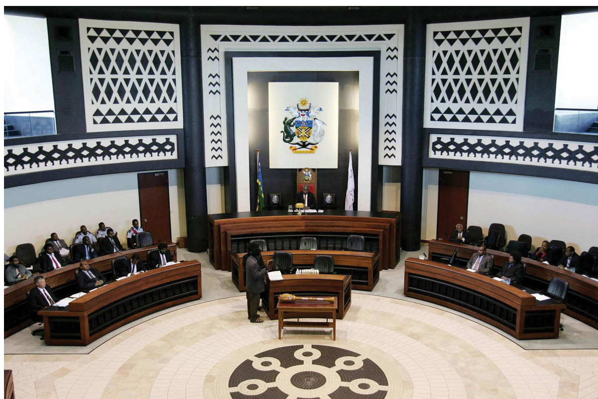
●● Members of Parliament are sworn-in at the opening session of parliament in Honiara, Solomon Islands, 24 April 2006.