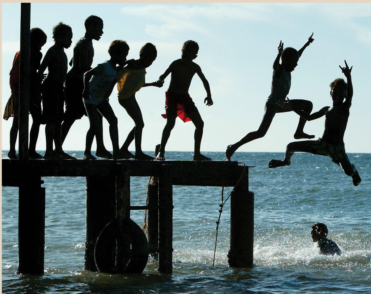
●● Children cool off in the tropical waters of Iron Bottom Sound in Honiara, Solomon Islands, 23 July 2003.

To broaden our understanding on the Pacific region's special situation of CSEC more research is needed. The research can also help identify culturally specific risk factors for effective prevention efforts. A multi-stakeholder collaboration between academic institutions, government agencies, civil society organisations and development partners is important for efficient use of resources, research and policy formulation.