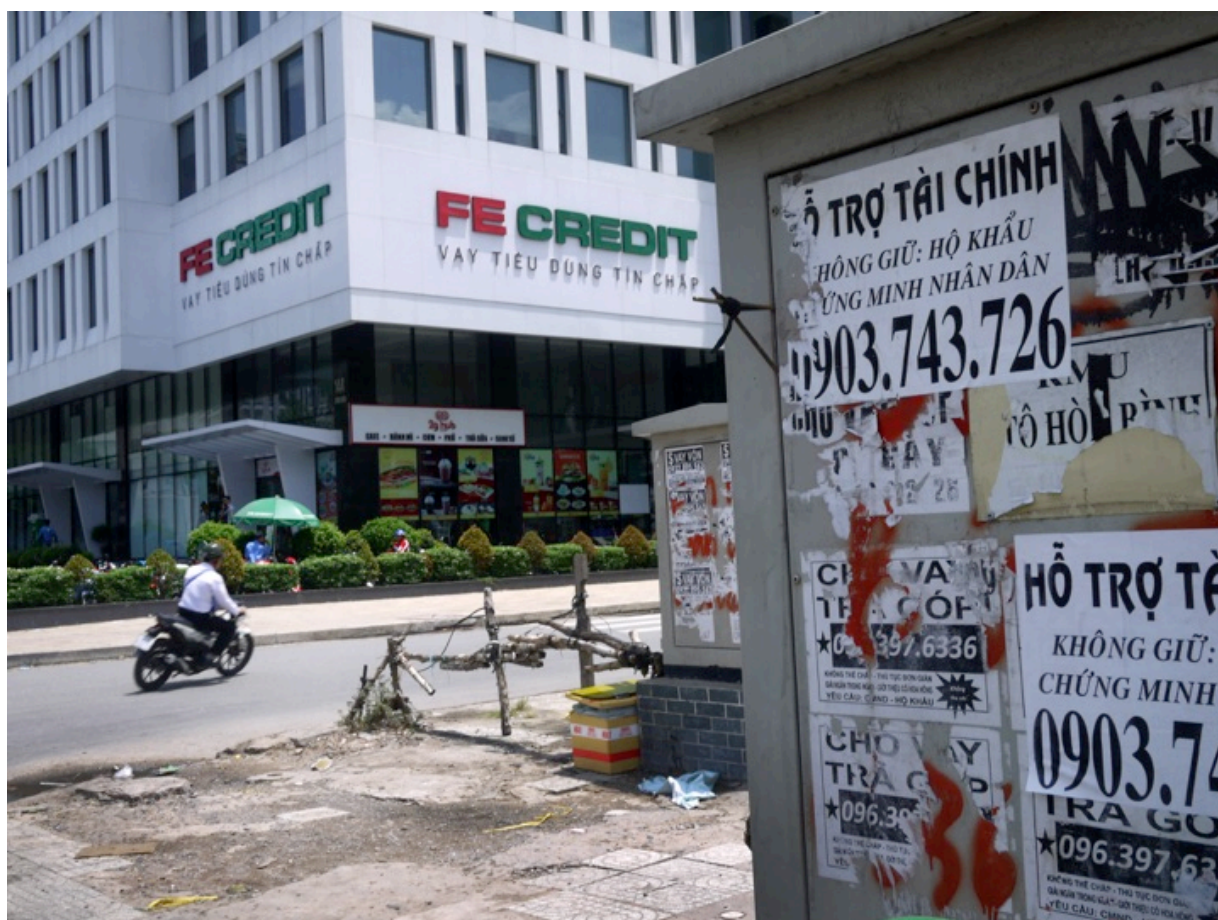
Figure 2: Advertisements for high-interest loans or ‘financial support’ ( hỗ trợ tài chính ) with no requirements for an ID are posted near FE Credit, the consumer finance branch of VPBank.

To sum up, neighborhood and giang hồ moneylenders do not collateralize sexual labor and wages to secure debt as pimps and managers do. Instead, they use harassment to recover loans. However, these two types of moneylenders operate differently. For the former, lending is confined to highly localized social spheres because of their need for intimate knowledge of borrowers and the maintenance of good social reputation. They show flexibility and use verbal harassment in last resort. For their part, giang hồ moneylenders lend money to all sort of borrower which they recruit through social networks and aggressive street and online marketing. A common technique consists of gluing posters on city walls with enticing messages like ‘hello, there is money,’ ‘borrow money quickly,’ and ‘borrow money, pay on installments’ (see figure 2). Giang hồ gangs built a reputation for aggressiveness, instill fear among borrowers and rely on violence to recover loans.