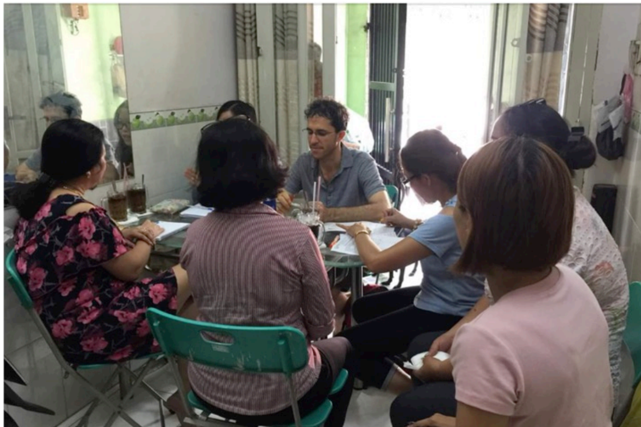
Figure 1: A group discussion with the outreach group ‘Riding the waves’ ( Nhóm vượt sóng ).