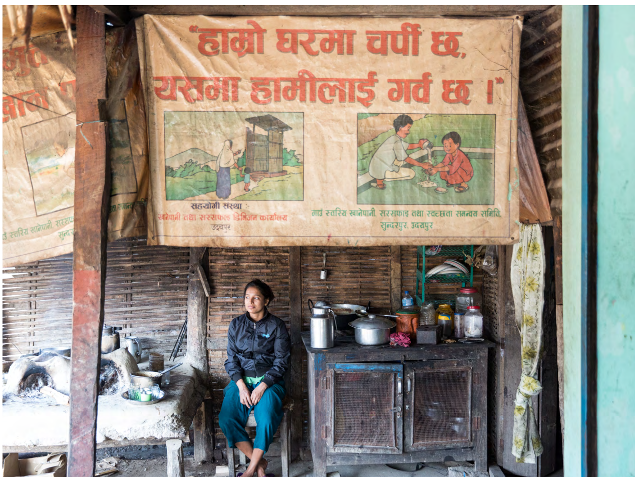
A little restaurant in Udaipur, Nepal, run by one of the many locals who have lost their houses and land because of river flooding. “The problem of flood is never ending here. When there is heavy rain, the river erodes the land. The largest river, Trijuga, is also there. There is a huge problem of flood in this region.”

The following table provides an overview of possible interventions before, during and after disasters, and where available with examples of related activities implemented by IOM in the Asia-Pacific region.