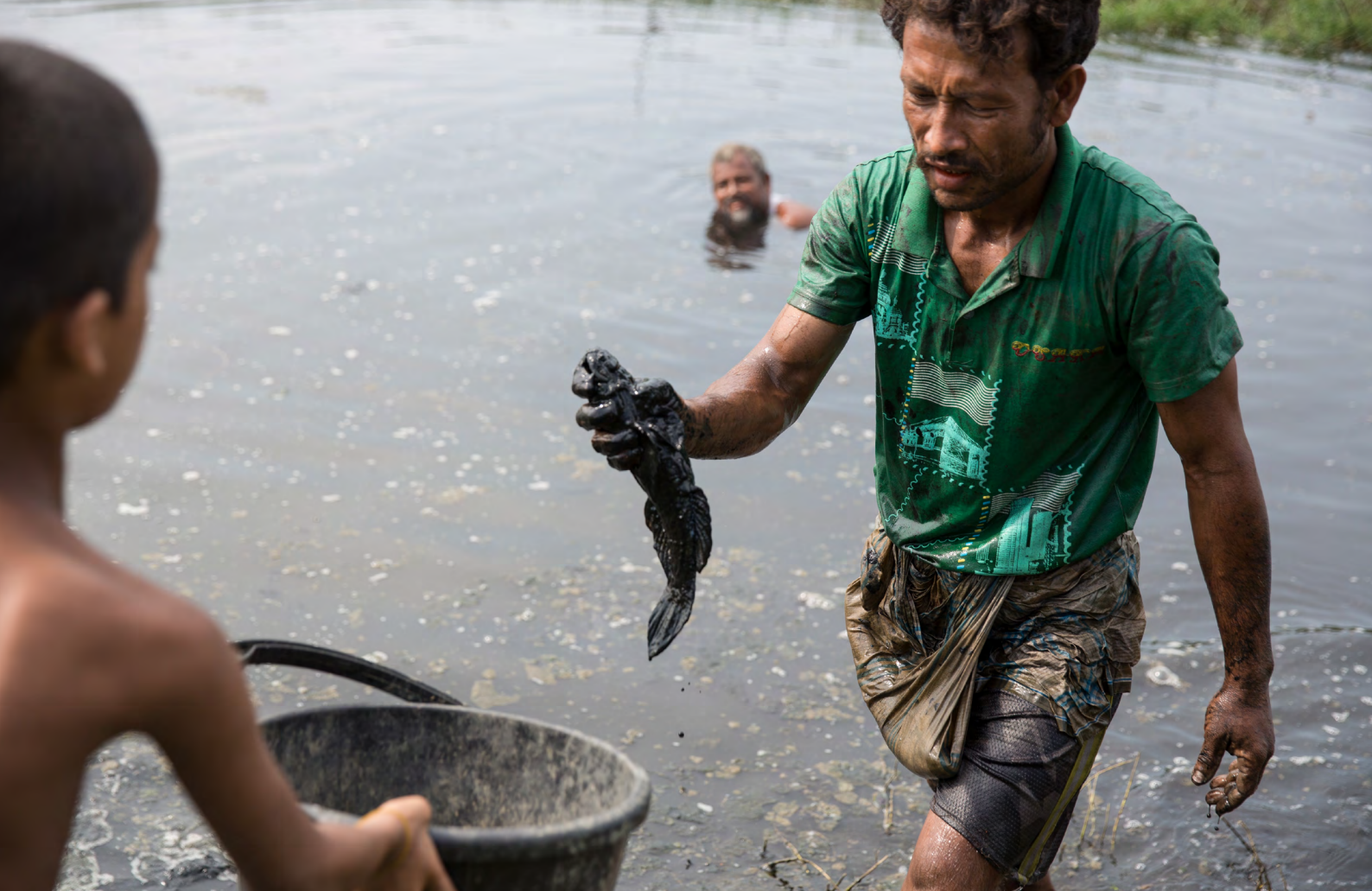
Fishermen in Shyamlapur, Bangladesh, fish about 22 kilos of fish per day and sell it on the local market in Cox's Bazar.

events can drive outmigration. Traffickers are likely to recruit in such source areas of climate migrants, but also at their destinations, such as in urban slums. On the other hand, when irreversible damage due to slow-onset events occurs (such as in the case of land erosion or repeated droughts), households may face increased debt and poverty. Increased desperation may push affected populations into the hands of criminal actors, and even into colluding with them, as seen in instances of men selling their wives or other female relatives 3 or parents selling their children 4 in order to cope with the losses associated with a changing climate. Although it can be a challenge to establish that slow-onset climate change contributes to increased TiP, there is enough anecdotal evidence