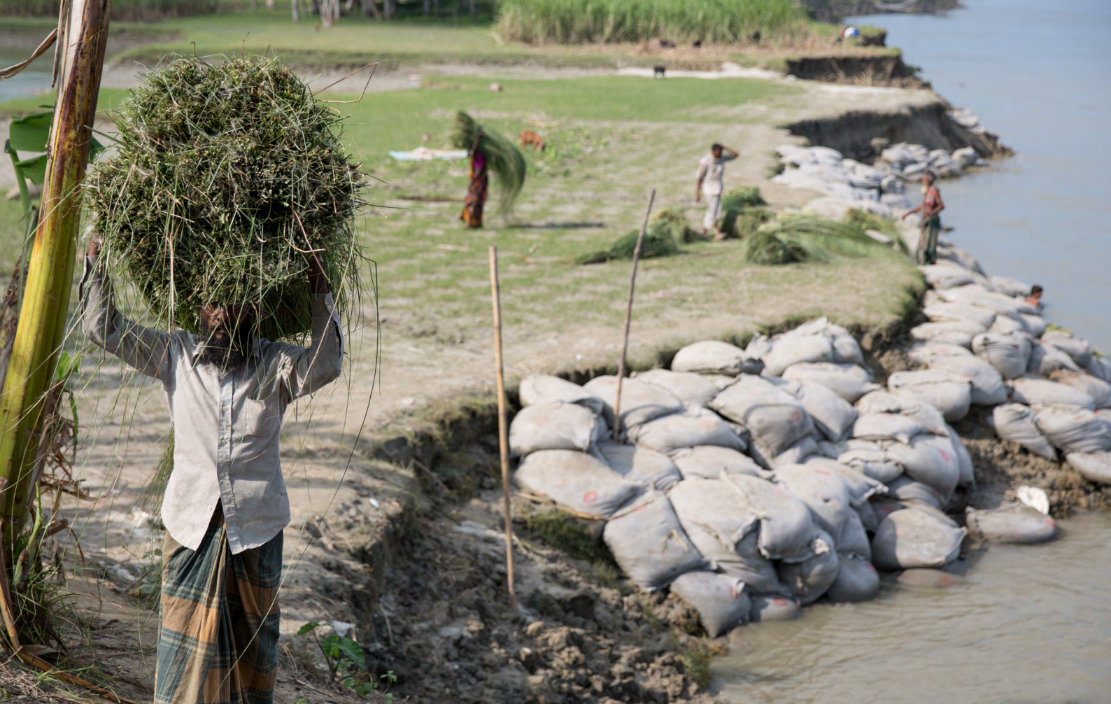
This community in Sirajganj, Bangladesh, is affected by river erosion. Many people were displaced several times due to the river erosion.

that these drought-affected families from agricultural villages are more likely to migrate. 18 As indicated in the IOM assessment study, these migrants tend to take illegal and often unsafe pathways as they are deemed easier and cheaper than migrating through regular channels. In fact, respondents to the IOM survey described instances of securing job opportunities through brokers, who would lead them to cross the forest into Thailand by foot, where they would be required to sleep and stay without nourishment for days before reaching their final destination. This could lead to situations of abuse and exploitation. 19