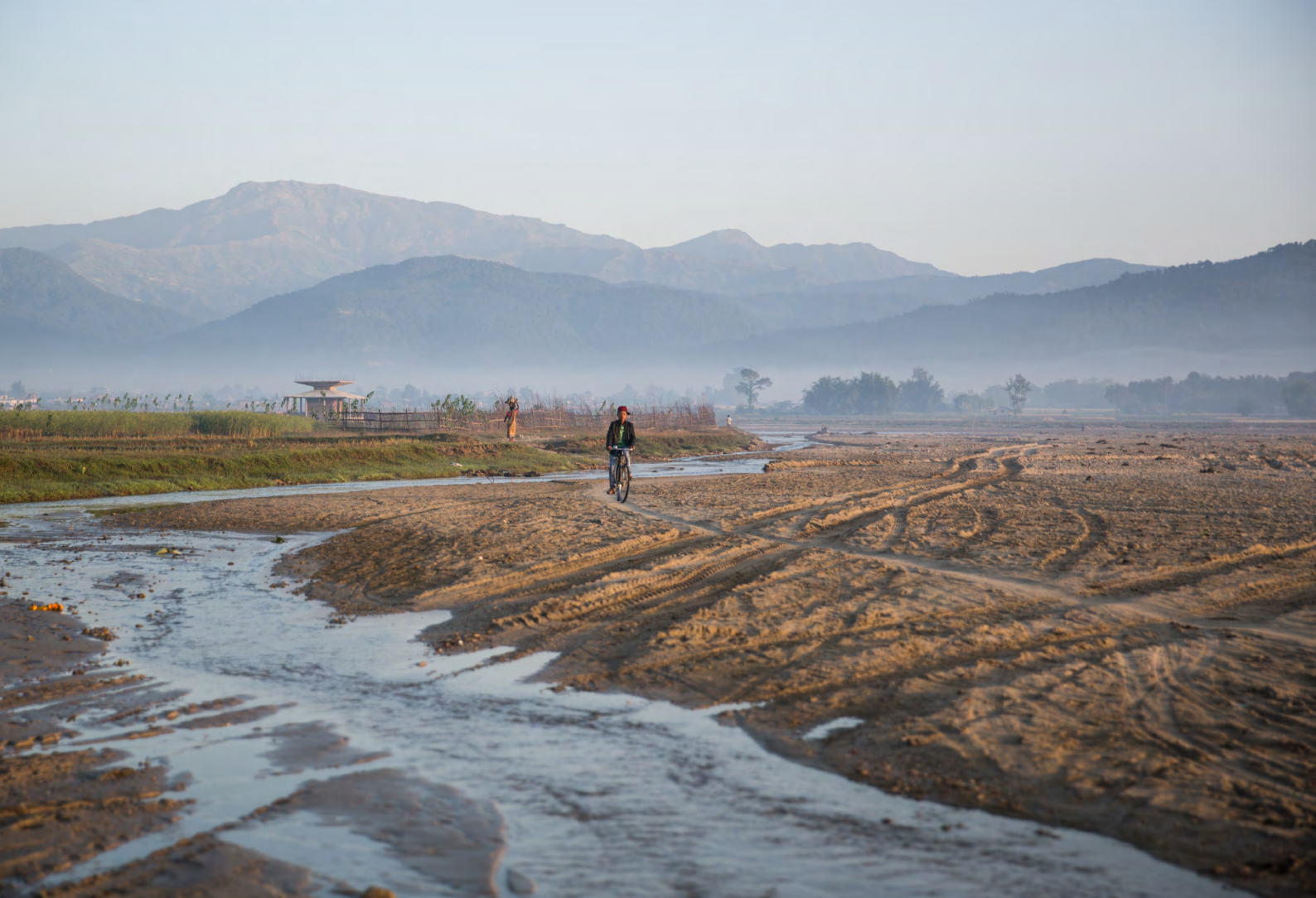
River in Udaipur region of Nepal during the dry season. Due to sedimentation in the Udaipur region intensified by heavy rains and deforestation, rivers are becoming shallower and broader, contributing to floods during monsoon.

human trafficking. While majority of the victims of trafficking in Asia–Pacific in 2015 were employed in fishing vessels, the logging industry and palm oil industry are also known to heavily exploit migrant workers. Since 2005, IOM has assisted 120 victims of trafficking from the palm oil industry in Indonesia; this figure is not representative of the number of victims of trafficking in the palm oil industry, which is expected to be higher as the absence of mechanisms to contact workers on remote plantations prevents the provision of assistance. Victims of trafficking supported by IOM reported that debt bondage, confiscation of documents and physical abuse were commonplace.