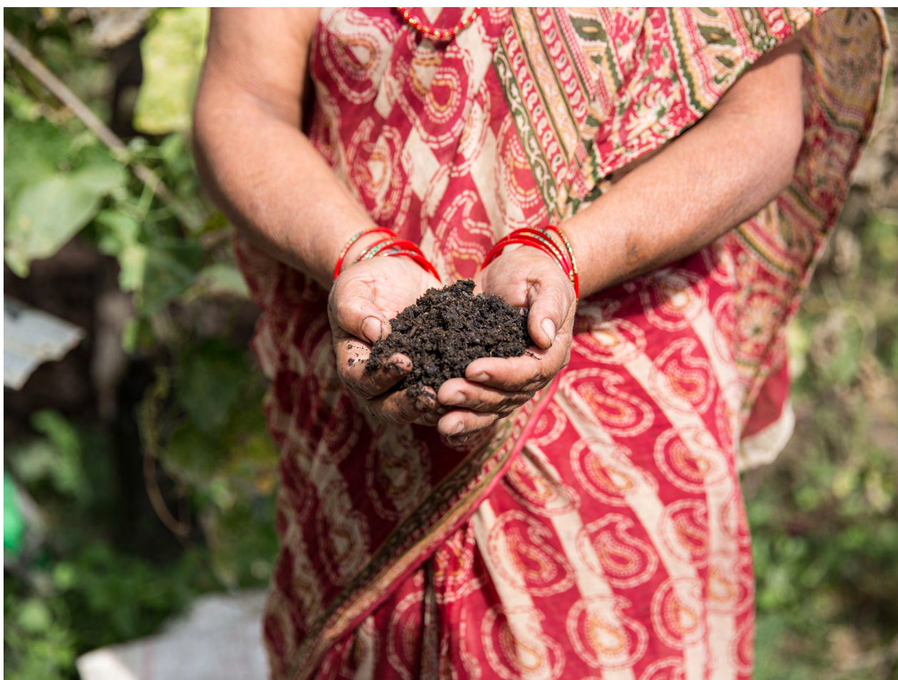
Organic fertilizer is being introduced to replace the industrial ones. Local farmers, such as those from Udaipur, make the organic fertilizers with cows and goats, urine and excrements and dried leaves.