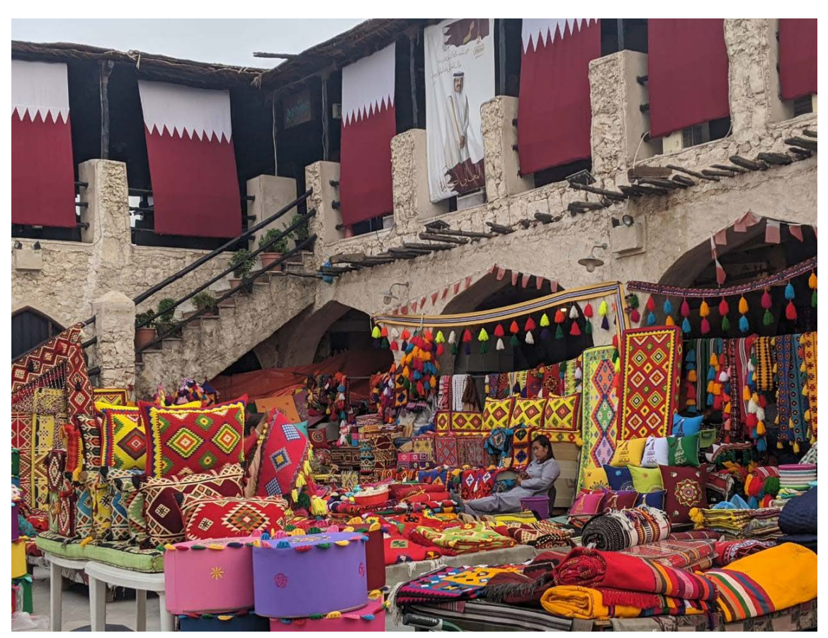
A migrant worker working as a shop assistant waits for customers at Souq Waqif in Central Doha. Apart from the laborers building the infrastructure of the country, migrant workers also work as cleaners, restaurant staff, security guards, shop assistants, drivers, and stewards; they shoulder the hospitality sector's efforts to accommodate the influx of people expected to visit the country in 2022.

Qatar, one of the world's wealthiest states on a per capita basis, is almost entirely reliant on some 2 million migrant workers who represent around 95 per cent of the country's total labor force and who are primarily employed in the construction and service industries.<sup>6</sup> Without such workers, many of whom come from some of the world's poorest countries in search of better work opportunities, the country would grind to a halt.<sup>7</sup>