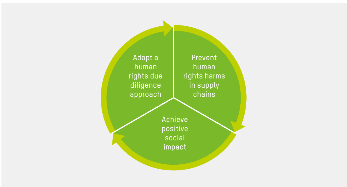
Figure 1: Oxfam's Workers' Rights Recommendations for Food Retailers 57

M&S may lack the leverage over standards that comes with size, and may be unable to compete on price with discount and online retailers. However, it can address specific problems over which it has influence within its own operations and supply chains. It can also use its the status as a longstanding, highly regarded and much-loved British brand to call for a more enabling environment for responsible businesses to compete, including smarter regulation and longer-term investor behaviour.