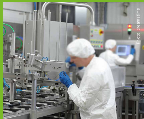
To achieve high quality products, some tasks cannot be done by machines

reliable workers willing and able to do the skilled work he does, he fears he may ultimately lose his job if he cannot have the operation.