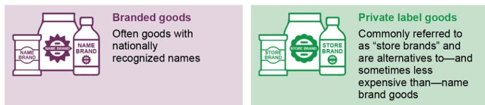
Figure 3: Product Types Sold in Department of Defense Commissaries and Exchanges

goods. Branded products are often products with nationally recognized names. Private label products are commonly referred to as “store brands” and are alternatives to—and generally less expensive than—branded products. (See figure 3.) Goods are called “direct import” when a company buys products directly from suppliers in another country, without using another person or organization to make arrangements for them.