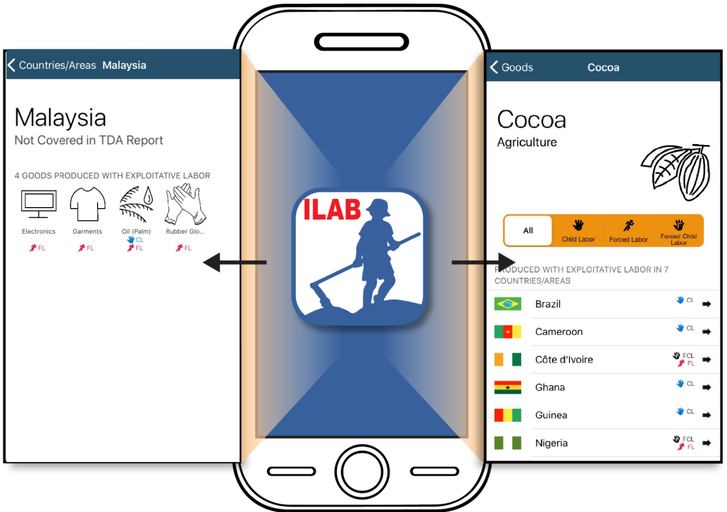
Figure 5: Department of Labor’s “Sweat and Toil: Child Labor, Forced Labor, and Human Trafficking Around the World” Mobile Application

Source: GAO based on Department of Labor’s Bureau of International Labor Affairs (ILAB) information. | GAO-22-105056