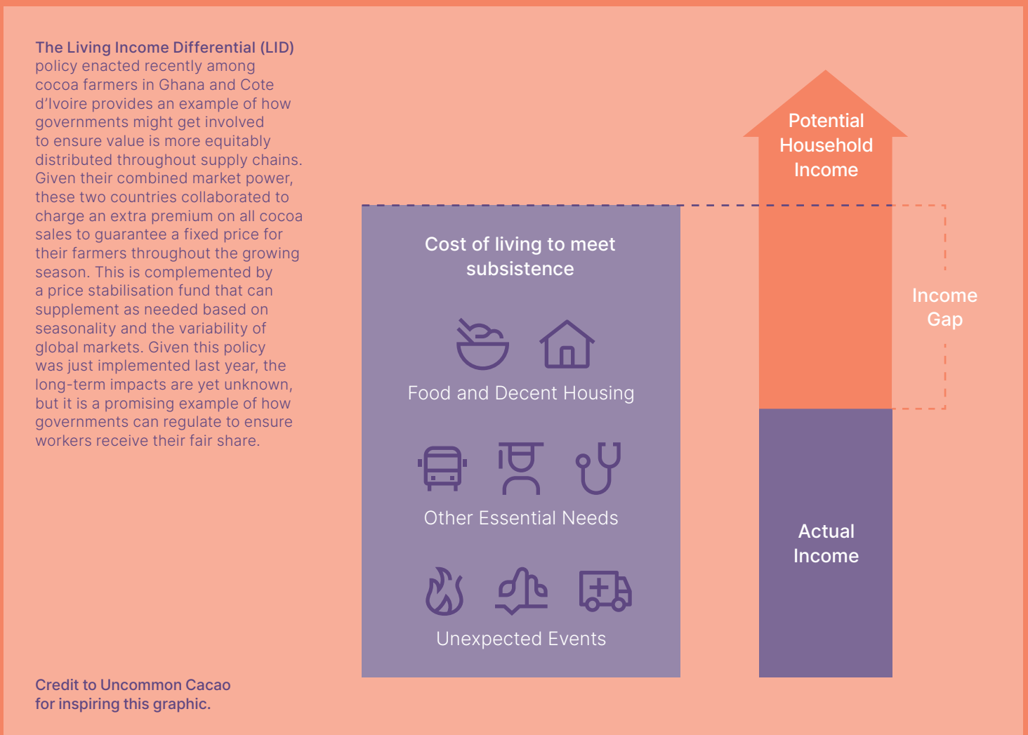
Figure 3: Understanding a Living Income

While there are many positive steps that the private sector can take toward eliminating forced labour from supply chains, government action is critical to reform existing incentive structures that drive exploitation. Notably, this centres on enacting regulations that ensure human rights-respecting corporate ethos and good governance extend deep into global supply chains.