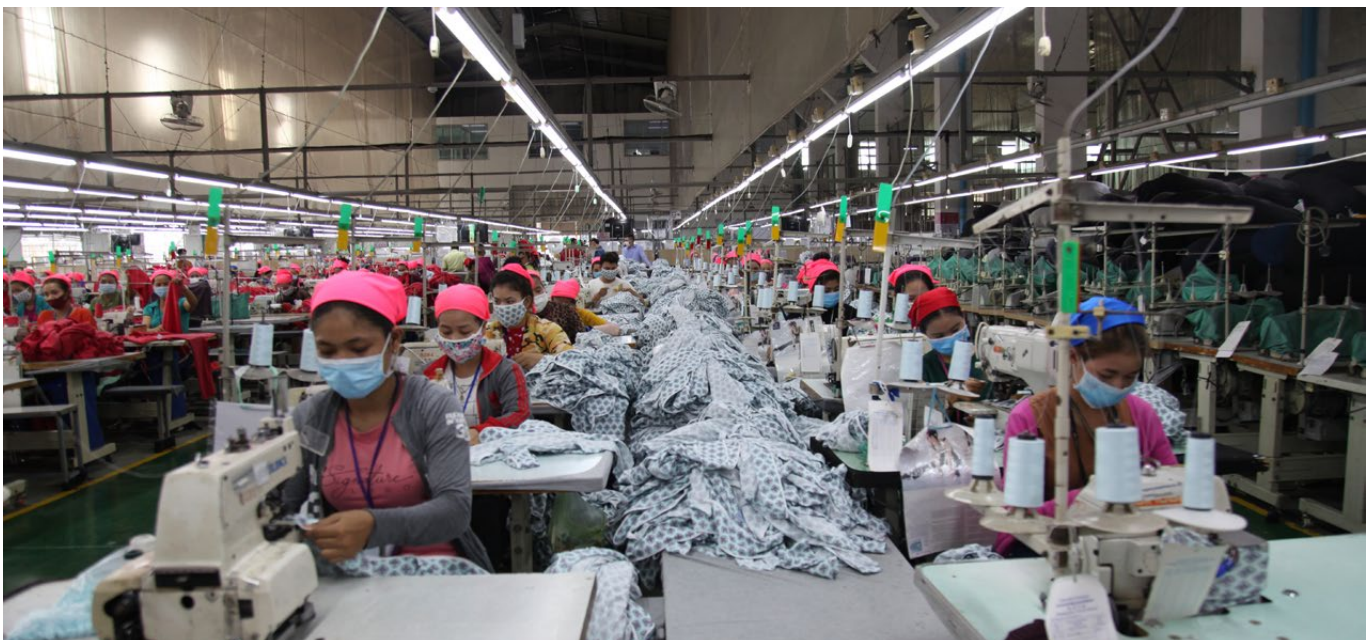
Garment workers in a factory in Cambodia during Covid-19 crisis.

Providing additional detail and clarification of certain concepts will be necessary to ensure that the legislative turn of the international norms realizes their full potential for having a positive impact on company practice and subsequently the situation on the ground for workers and communities. Thus, when translating the soft-law expectations into hard-law obligations for companies, it is important to preserve the original intent and spirit of these standards, keeping in mind that the ultimate objective is to achieve better outcomes for people in terms of increased respect for human rights and greater access to justice and remedy.