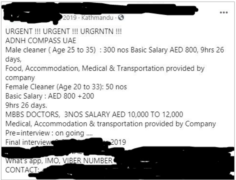
Figure 2.3 Sample of job advertisement posted on PRA7 Facebook page

Source: PRA7. 'Urgent!!! Urgent!!! Urgent!!! FREE VISA FREE TICKET!!! ADNH COMPASS UAE.' Facebook, 6 November 2019. © Meta.<sup>32</sup>