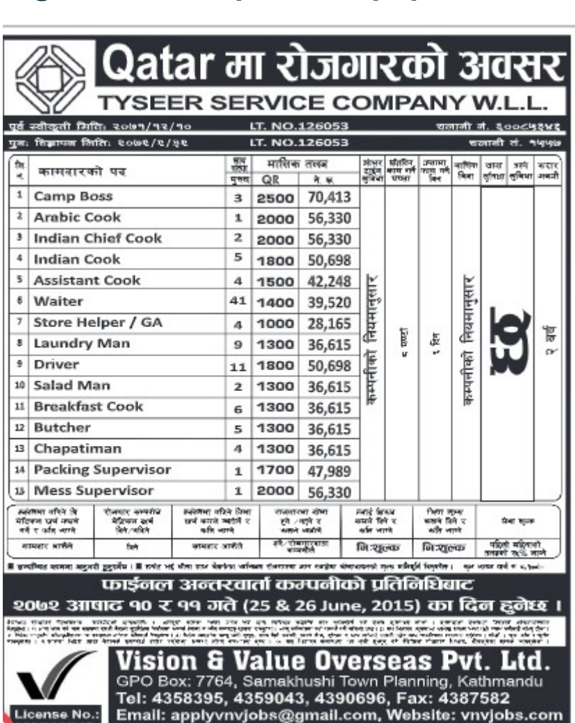
Figure 2.2 Sample newspaper advertisement