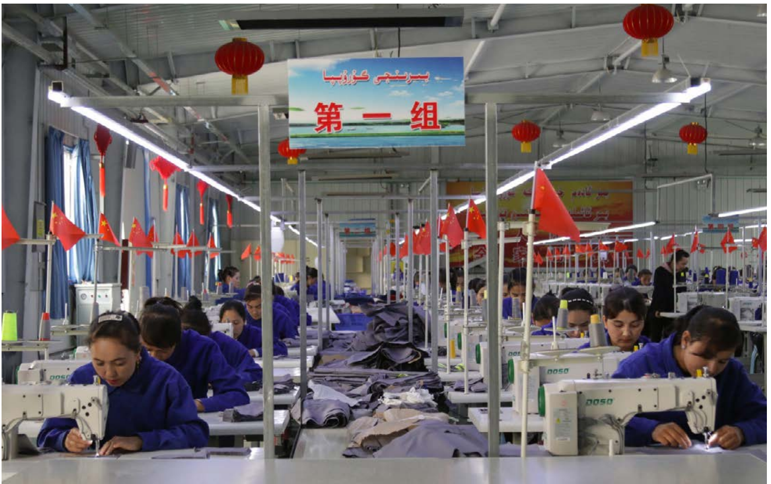
Uyghur women work in apparel factory.

The PRC claims that these labor transfer programs are part of a national campaign for “poverty alleviation.” However, the programs involving Uyghurs and other minoritized citizens operate differently from other “poverty alleviation” programs throughout China, because for individuals from the Uyghur Region, the constant threat of internment makes refusing the state-sponsored work placement impossible. Labor transfers are deployed in the Uyghur Region within an environment of unprecedented fear and coercion. Refusal to participate in any government programs, such as labor transfers, for reasons perceived to be religious in any way, is viewed as equivalent to aligning oneself with the three evils – separatism, terrorism, and religious extremism – and thus anyone who refuses to work or attempts to walk away from their job, risks internment or imprisonment. Therefore, the programs are tantamount to the forcible transfer of populations, forced labor, human trafficking, and enslavement by international definitions and protocols.